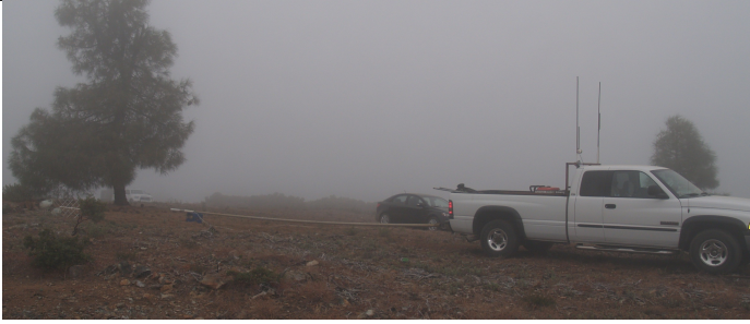
Almost ready to erect the 30' irrigation pipe loaded with a DK3, a guy ring/ropes and two halyards for hoisting some dipoles in sloper positions.